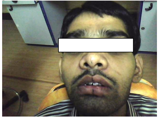
Fig.8 Postoperative frontal view after 2 years

Intervention under general anaesthesia has been explained to the patient and patient's guardian in their own language with written consent.