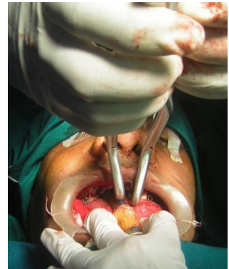
Fig.5 Intraoperative maxilla reduction by ROWE's disimpaction forceps

Fig.4 Intraoperative circumvestibular incision and exposure of fracture site bilaterally