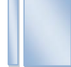
Figure 2: Reasons for not adhering to treatment